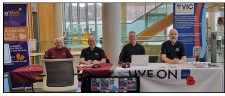
Rochdale outreach has resumed afterthe Christmas break at Number One Riverside, in Rochdale, on Thursday mornings.